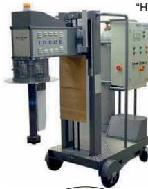
Hydrogen content ? "HYDROGEN-ANALYSER" / ccm/100g