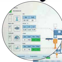
Documentation / Analysis ?

Central test data such as spectral, hardness, ... "Networking / QA-Software"